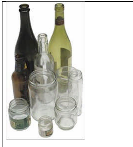
Many glass containers could be cleaned and re-used but without container deposit legislation there is little economic incentive to do this.

Composite or mixed materials are becoming more common in packaging. These include wax on cardboard cartons, and plastic film and foil bonded onto paper, making a packaging that's strong and lightweight to transport, but hard to recycle. Some labels on plastic containers are a different plastic from the container. Other examples of mixed packaging materials are 'blister packs' of clear plastic glued to bar-code printed card, on items that traditionally were sold loose. Supermarkets drove this trend.